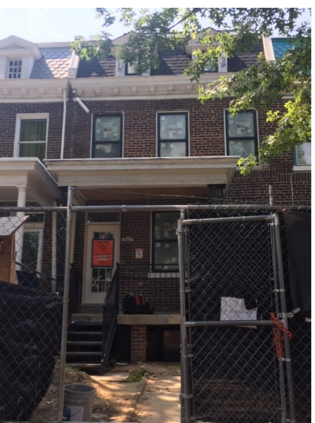
532 Taylor St - Placard Detail